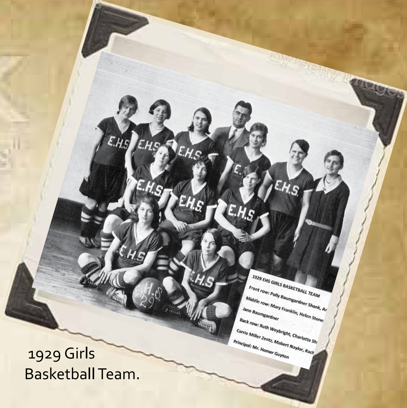
1929 Girls Basketball Team.

EHS had a diverse athletics program for both boys and girls. Sports included field hockey, soccer, basketball, baseball, volleyball, and softball. EHS students, sports teams, and other school organizations were known as the Emmitsburg Liners because of the town's close proximity to the Mason-Dixon Line. The school colors were blue and white.