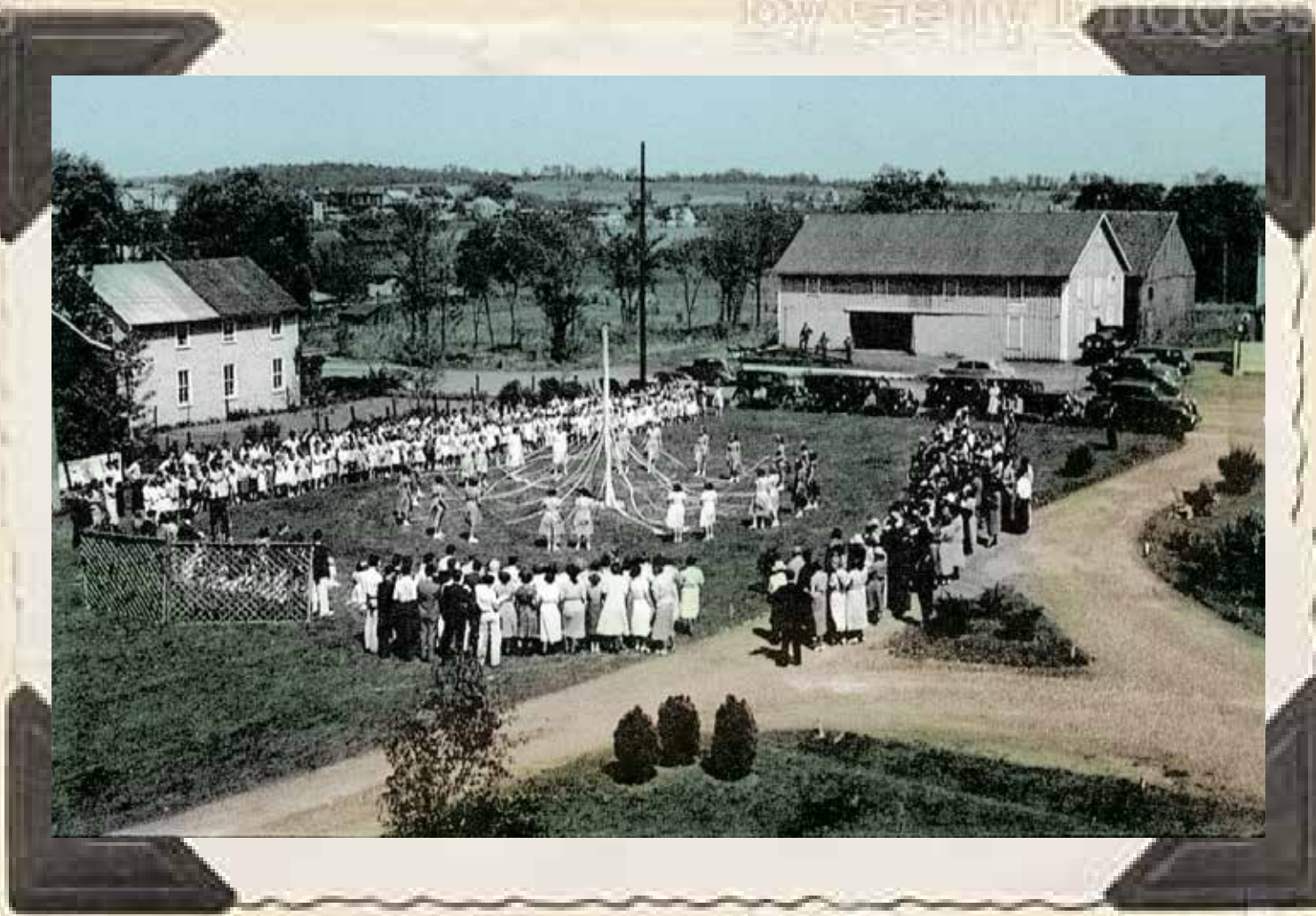
1938 May Day Festival shows students about to begin the Maypole dance as local residents look on. The Annual May Day Festival, unique to EHS among county schools, included the crowning of the May Day queen.